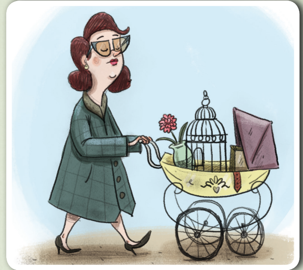
Dora the Storer