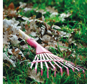
Raking up leaves