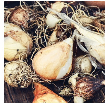
Bulbs ready for planting