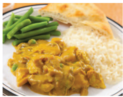
Chinese Chicken Curry served with Rice, Naan Bread & Seasonal Vegetables