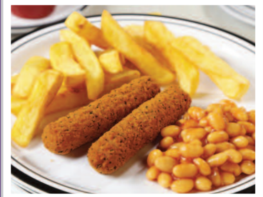
Breaded Mozzarella Sticks served with Chips & Peas or Baked Beans