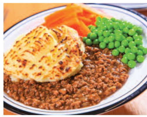
Cottage Pie served with Seasonal Vegetables