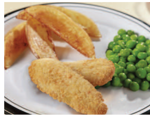
Breaded Chicken Goujons served with Potato Wedges & Seasonal Vegetables