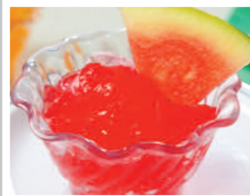
Jelly & Fruit