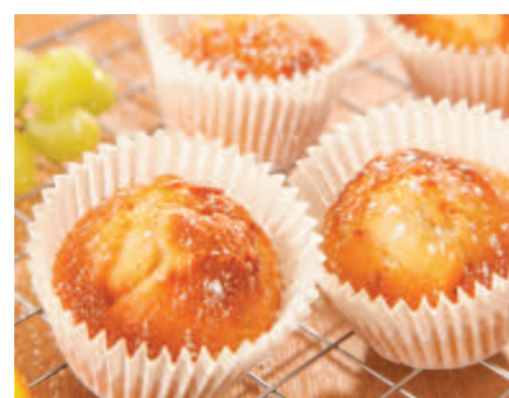
Apple & Cinnamon Muffin