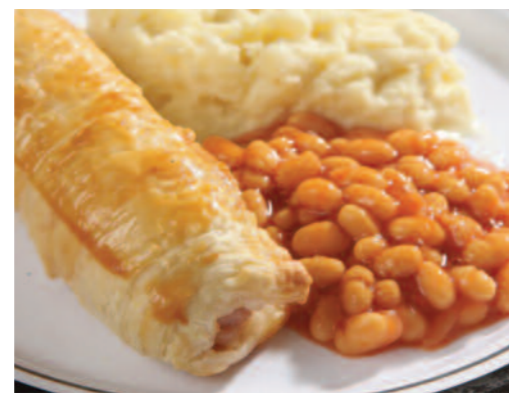
Homemade Sausage Roll served with Mashed Potato & Baked Beans