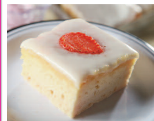
Strawberry Ice Cream Cake