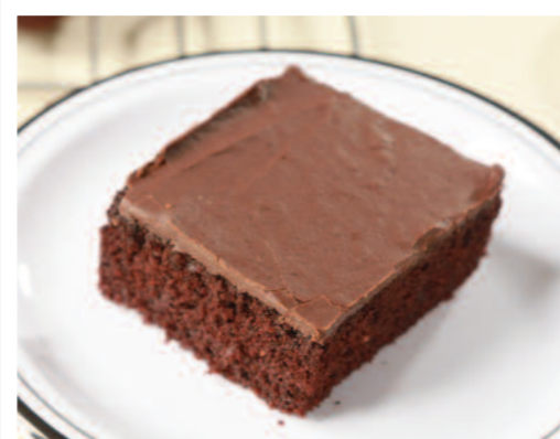
Wacky Chocolate Cake