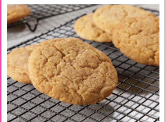
Snicker Doodle Biscuit

AVAILABLE DAILY – UNLIMITED SALAD, FRESHLY BAKED BREAD, FRUIT YOGHURT, FRESH FRUIT PLATTER & CHILLED WATER. FOR ALLERGEN INFORMATION, PLEASE ASK ONE OF OUR CATERING TEAM. ALL THE ABOVE DISHES ARE SUBJECT TO AVAILABILITY.