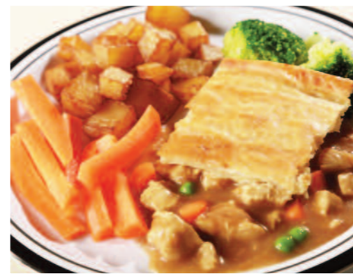
Homemade Chicken Pie served with Diced Crispy Potatoes & Seasonal Vegetables