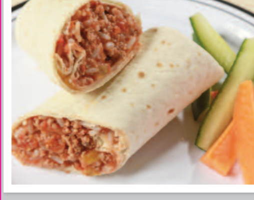
Cowboy Beef & Rice Burrito served