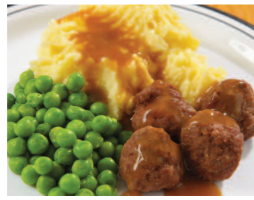
Meatballs in Gravy served with Mashed Potato and Seasonal Vegetables