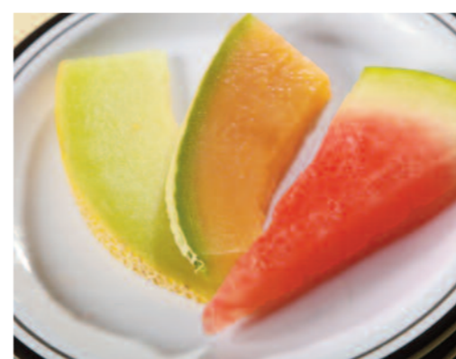
Trio of Melon