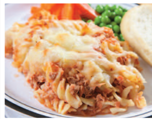
Tuna Pasta Bake served with Crusty Bread and Seasonal Vegetables